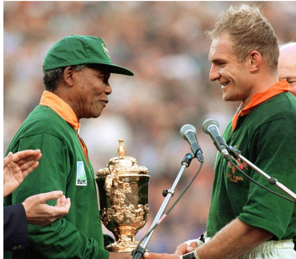
South Africa's president Nelson Mandela congratulates South Africa's rugby team captain François Pienaar before handing him the William Webb trophy after his team's victory over New Zealand (15-12) in the final of the Rugby World Cup at Ellis Park in Johannesburg 24 June 1995.

The story closes with a powerful personal encounter with Nelson Mandela - Madiba. In this emotionally resonant zone, a series of remarkable personal accounts from family members, colleagues and high profile figures from Hollywood, the music industry and politics reveal the profound impact he had on them and their lives, and his qualities as leader and statesman. Film footage engages visitors with Mandela himself – his philosophy, values and wisdom – in his own words. Finally, visitors are invited to contribute to a memory tree, to share their own feelings about what Madiba means to them, and to think about how we can all adopt some 'Madiba values' into our lives and be part of his legacy.