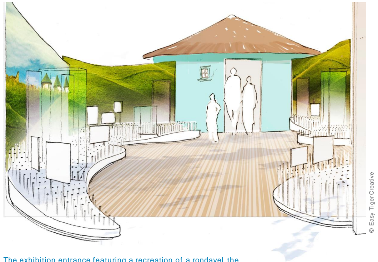
The exhibition entrance featuring a recreation of a rondavel, the traditional circular South African dwelling with a thatched roof.

Visitors will learn more about Mandela's beginnings in the rural Transkei, steeped in Xhosa tradition, including his initiation ceremony. It introduces the people and places that shaped him, and the roles they played in defining his personality, philosophy and style of leadership.