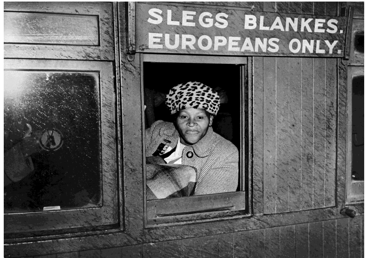
Like many of her peers, this woman sat in a carriage reserved for white people to protest against the systematised racial segregation of the apartheid regime in South Africa in 1952.

Activities also link to other subjects including: Geography, Religious Education, Sociology, Critical Thinking, Law, Politics, Media Studies, Theatre studies, Physical Education, Music and Visual Art