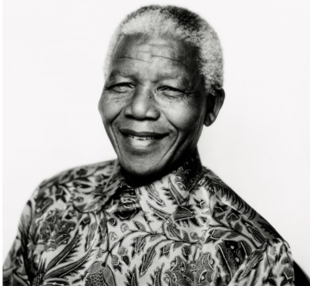
Nelson Mandela portrait, 1998